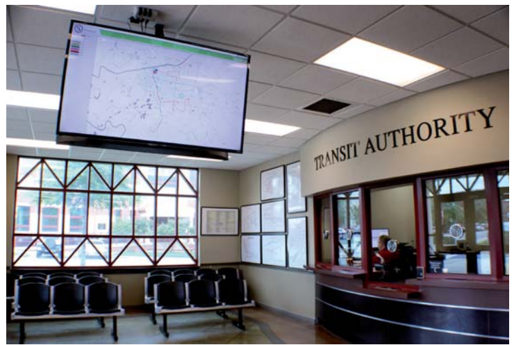
Mapping created by the Transportation and Planning Department at WARC is seen in the lobby of the Tuscaloosa Transit Authority.