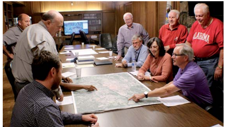
Members of the MPO citizens committee look over a map together during a recent meeting.

The plan describes numerous strategies the MPO uses to involve the public in the transportation planning process. As called for in the plan, the MPO staff evaluates the planning process every year by checking the adopted performances measures. The evaluation becomes part of the annual Record of Public Involvement (RPI). The RPI, also a plan requirement, documents all public involvement activities of the MPO. Since 2013, the plan has included the MPO Title VI program and Limited English Proficiency Plan.