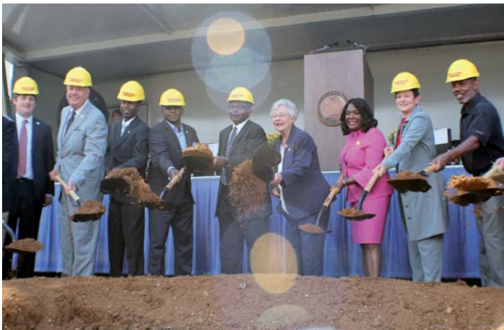
State and local leadership breaks ground at the site of the Loves Travel Stop in Eutaw.